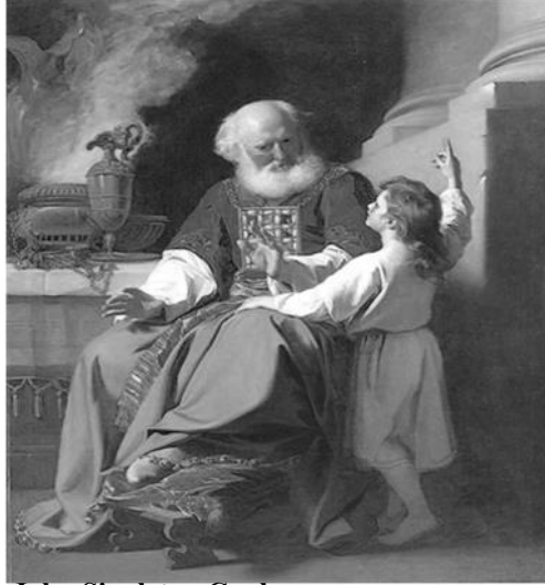
John Singleton Copley Samuel Waking Eli in the Night (1780)

Today we focus on our call from God. Both Samuel and Jesus' disciples were called. Unfortunately, not everyone realizes he or she has been called to be a disciple. Pope Francis insists that by virtue of baptism we are all missionary disciples. What does this mean? What does it ask of us? Today's readings set the stage for our consideration of discipleship. They tell us several things. As with Samuel, the invitation from God can be unexpected, for it can occur in the very ordinary events of life. Perhaps, like Samuel, we don't hear the call because the event is so ordinary. Maybe we need someone to open our eyes to God's presence