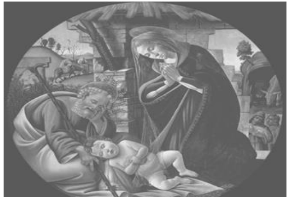
The Adoration of the Christ Child – Alessandro Botticelli (ca 1500)

Joseph could count on nothing in this world to be his stay. Neither his trade nor property were employed in his first years as father of the Divine child. He had to abandon all that was his and provide for them in whatever way was possible as they were on pilgrimage to Bethlehem, to Egypt, and finally to Nazareth.