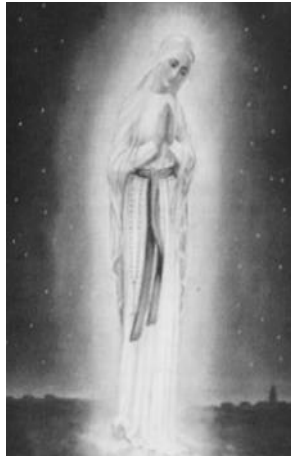
OUR LADY OF THE POOR

Give us a heart as beautiful, pure, and spotless as yours. A heart like yours, so full of love and humility. May we be able to receive Jesus as the Bread of Life, to love Him as you loved Him, to serve Him under the mistreated face of the poor. We ask this through Jesus Christ our Lord. Amen.