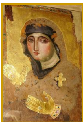
Algiosoritissa (Mother of God), Constantinople, 7th century

My Queen, My Mother, I offer myself entirely to you. And to show my devotion to you, I offer you this day, my eyes, my ears, my mouth, my heart, my whole being without reserve. Wherefore, good Mother, as I am your own, keep me, guard me as your property and possession. Amen.