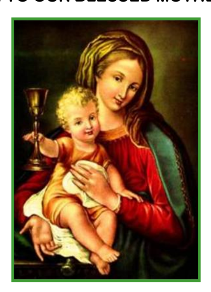
Our Lady of the Most Precious Blood, Pray for us