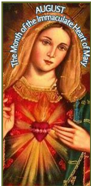
Pray The Rosary Daily

In 1945 Pope Pius XII extended to the entire Church devotion to the Immaculate Heart of Mary ... the safe haven in the midst of the tempest that everywhere assails us. Through the symbol of Mary's heart we venerate her most pure and perfect love for God and her motherly love for each one of us. In her heart we can find a refuge in the midst of all the difficulties and temptations of life, and we ask her to prepare for us the safe way, the way by which we will soon reach her Son.