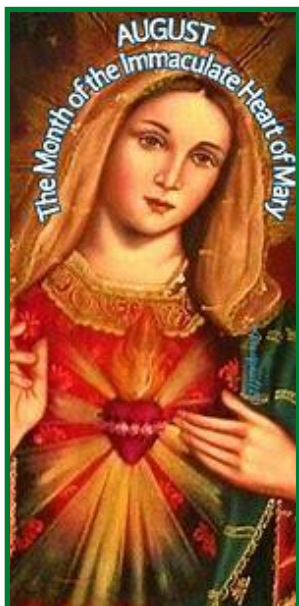
Pray The Rosary Daily

In 1945 Pope Pius XII extended to the entire Church devotion to the Immaculate Heart of Mary ... the safe haven in the midst of the tempest that everywhere assails us. Through the symbol of Mary's heart we venerate her most pure and perfect love for God and her motherly love for each one of us. In her heart we can find a refuge in the midst of all the difficulties and temptations of life, and we ask her to prepare for us the safe way, the way by which we will soon reach her Son.