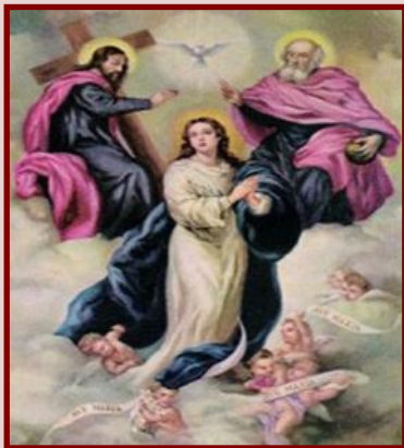
Blessed Virgin Mary Daughter of the Father Mother of Jesus Christ, the Son Spouse of the Holy Spirit